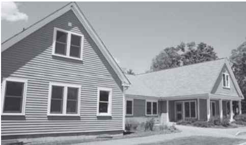
Richmond Area Health Center

The Rewards & Recognition Committee of HealthReach Community Health Centers would like to recognize the staff of Richmond Area Health Center (RAHC) for working through the challenges of the remodeling effort. The front office staff, waiting room and nurses offices are now temporarily located in a modular building adjacent to the Health Center. Staff members are needing to move frequently between the two buildings, and winter weather conditions are only adding to the inconvenience. Thank you, RAHC staff, for your patience,